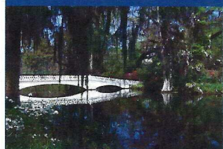
Take in the Picturesque Views of Charleston