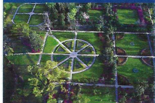
Visit Middleton Place and Gardens