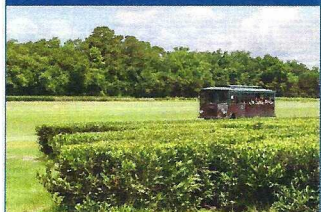
Tour Charleston Tea Gardens