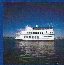
Cruise Around Charleston Harbor